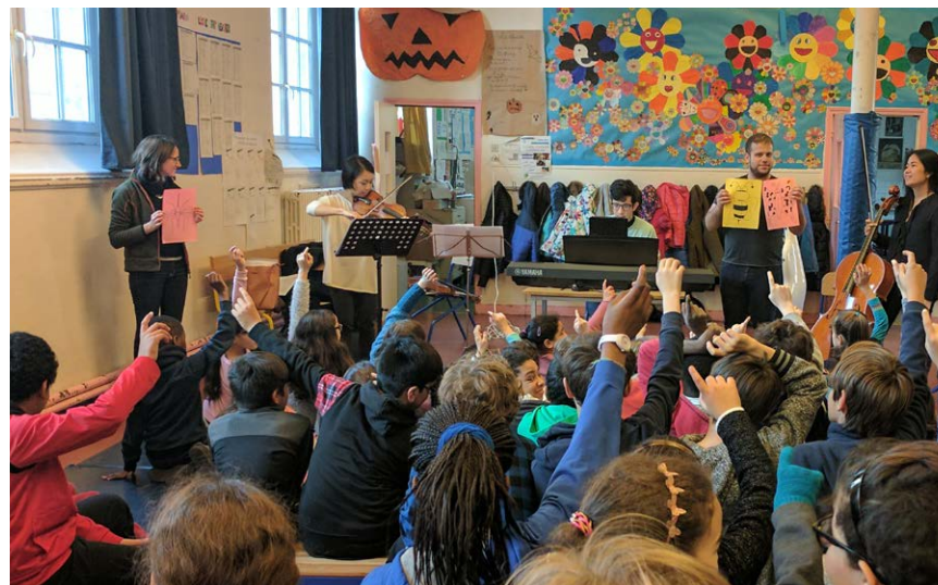
Interactive performance at Dorothy Nolan Elementary School in Saratoga Springs