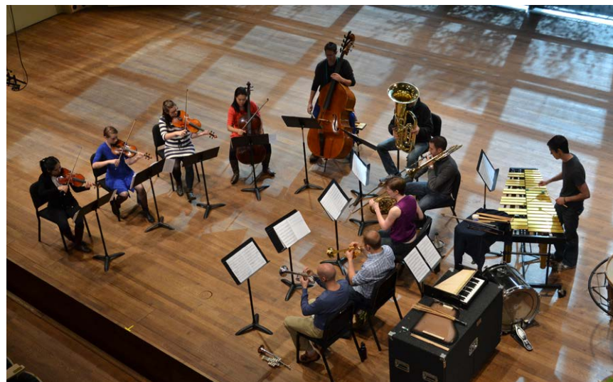
Ensemble Connect rehearsal at Skidmore College

Twice annually, the fellows participate in a five-day residency at Skidmore College in Saratoga Springs, New York. While on campus, the fellows offer master classes, lessons, and class demonstrations, as well as play side by side with students of the Skidmore College Orchestra and read student compositions. Ensemble Connect performs in the Arthur Zankel Music Center's Helen Filene Ladd Concert Hall, presenting concert programs that include world premieres commissioned by Carnegie Hall. The commissioned composers collaborate with the fellows during the residency before the world-premiere performances. In addition, the fellows and composers offer interactive demonstrations and informal performances beyond the music department in classes, dormitories, and libraries, as well as in schools and other community venues in Saratoga Springs.