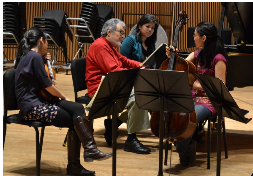
Master class with pianist Leon Fleisher