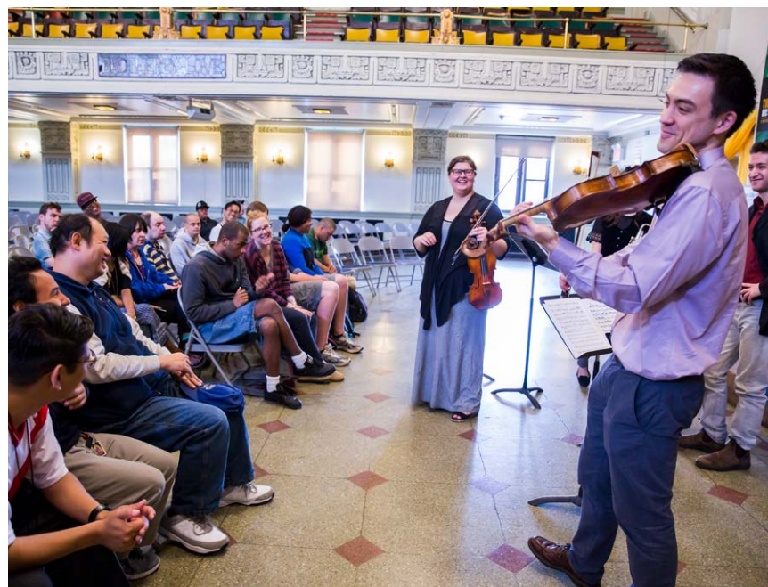
Interactive community performance at AHRC