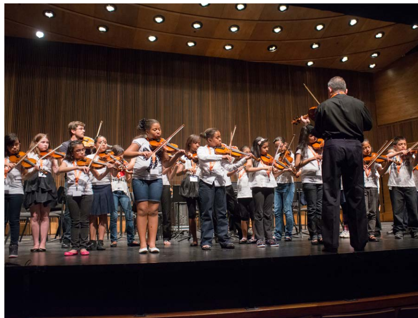
Partner School Performance Festival at The Juilliard School