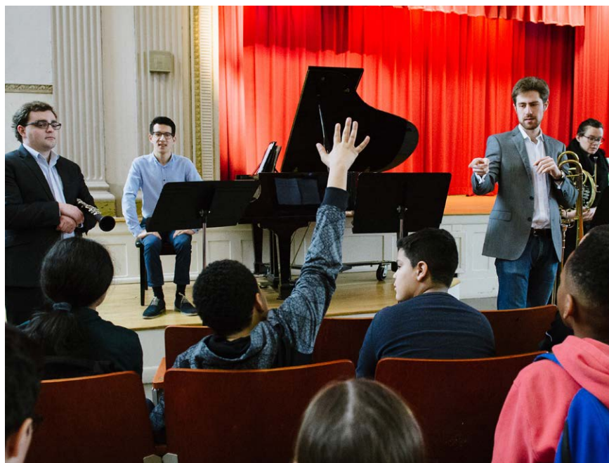
Ensemble Connect fellows presenting an interactive performance at MS224 Manhattan East

Each year Ensemble Connect presents 80 interactive performances in schools and 20 in community venues across New York City. Interactive performances are designed to invite audiences into the exploration and discovery of a piece of music or a musical concept and include listening activities aimed at deepening and enriching the concert experience. Fellows perform these assembly-style for large, schoolwide audiences and also adapt them for community venues such as prisons, senior care facilities, homeless shelters, and organizations working with special needs populations.