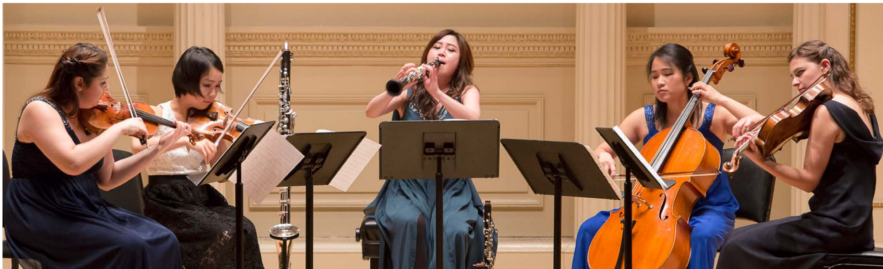
Performance at Weill Recital Hall