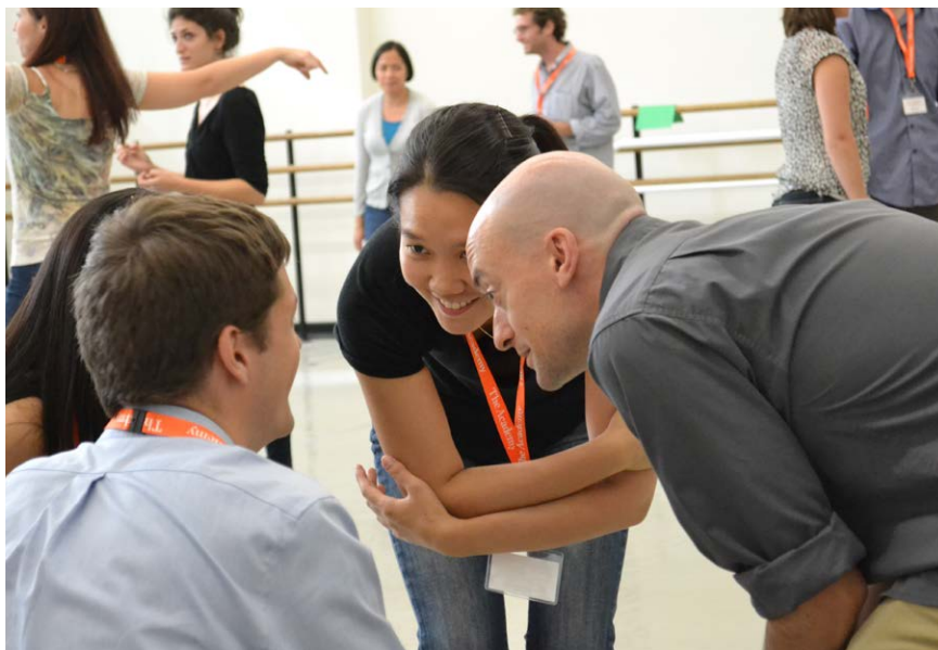
Professional development workshop

Fellows also receive coaching sessions with musicians of their choice such as Pamela Frank, Leon Fleisher, and Charles Neidich, along with access to world-renowned composers such as John Adams, David Lang, and Steve Reich.