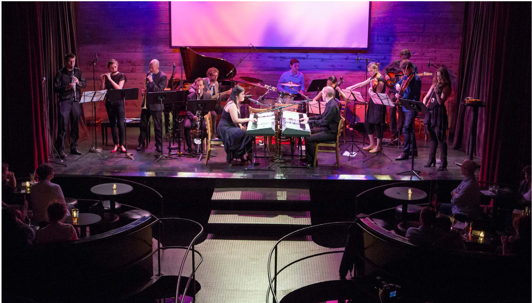
Ensemble ACJW performance at Galapagos Art Space in Brooklyn

“A valuable part of New York’s musical fabric ... thoughtful, invigorating programs.” — The New York Times