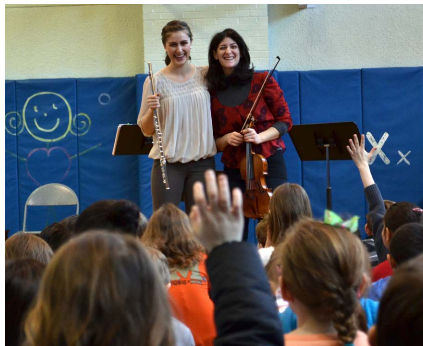
Interactive performance at Dorothy Nolan Elementary School in Saratoga Springs