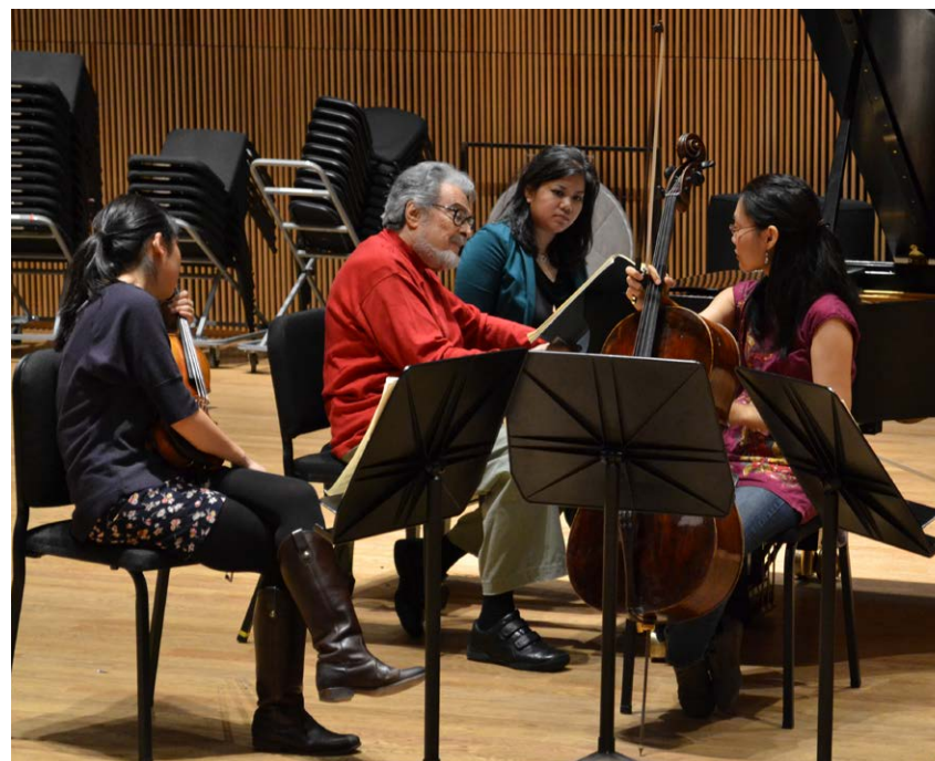
Master class with pianist Leon Fleisher