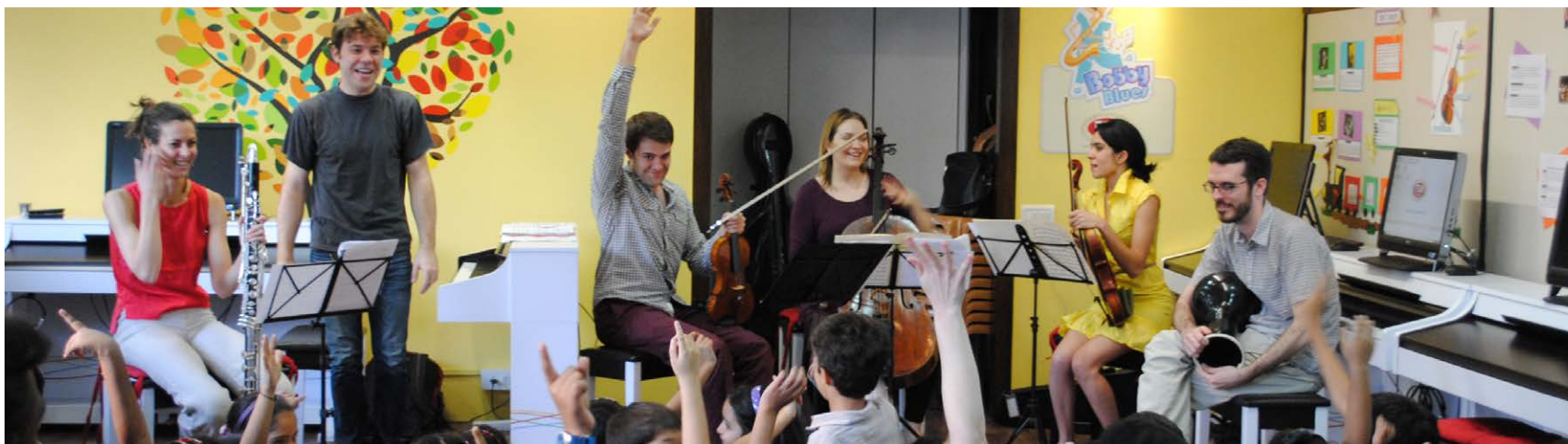
An interactive performance at Furtados School of Music in Mumbai, India, with ACJW alumni

Carnegie Hall maintains close relationships with the program's 83 alumni. As the reputation of Ensemble ACJW has grown, demand for work by its alumni has developed as well. In recent seasons, alumni ensembles have participated in residencies through Carnegie Hall in Abu Dhabi, Iceland, South Africa, Spain, Mumbai, Tokyo, Mexico City, and Germany. In 2011, Decoda—an ensemble exclusively made up of Ensemble ACJW alumni—was formed. The group was recently named as an affiliate ensemble of Carnegie Hall. Program alumni have also co-founded music ensembles and festivals, such as Third Coast Percussion, Genghis Barbie, New Docta International Music Festival, Las Vegas Wine and Music Festival, Scrag Mountain Music, Miami Chamber Music Society, and Musicambia. They are members of world-renowned orchestras and ensembles, such as the New York Philharmonic, Chamber Music Society of Lincoln Center, Orchestra of St. Luke's, The Knights, Canadian Brass, and Bryant Park Quartet. Many alumni also hold faculty and guest artist teaching positions at US universities and colleges. Additionally, alumni perform with current fellows in Ensemble ACJW, lead professional development sessions, serve as advisors for current fellows, and perform as part of the Weill Music Institute's Musical Connections program.