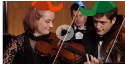
43 Cartoon Theme Song Mashup