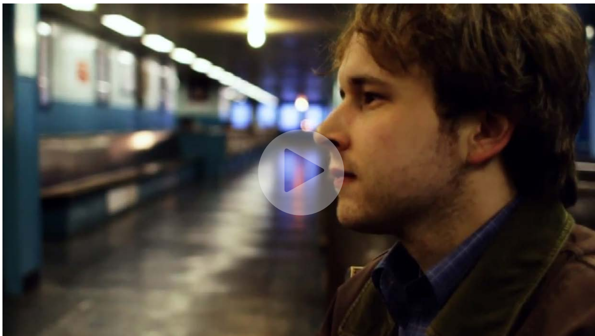
Ensemble ACJW Collaborates: A Day in the Life of an Ensemble ACJW Fellow