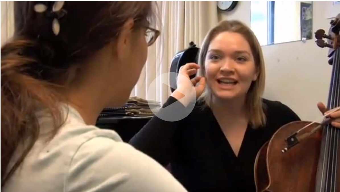
Ensemble ACJW Skidmore Residency (Funding credits listed as of December 2009)

Twice annually, the fellows participate in a five-day residency at Skidmore College in Saratoga Springs, New York. While on campus, the fellows offer master classes, lessons, and class demonstrations, as well as play side by side with students of the Skidmore College Orchestra and read student compositions. Ensemble ACJW performs in the Arthur Zankel Music Center's Helen Filene Ladd Concert Hall, presenting concert programs that include world premieres commissioned by Carnegie Hall. The commissioned composers are present during the residency to collaborate with the fellows before the world-premiere performances. In addition, the fellows and composers offer interactive demonstrations and informal performances beyond the music department in classes, dormitories, and libraries, as well as in schools and other community venues in Saratoga Springs.