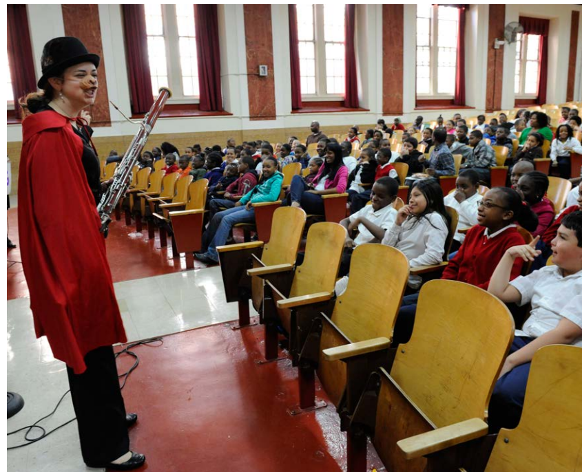
An interactive performance at PS 241K Emma L. Johnston Elementary School