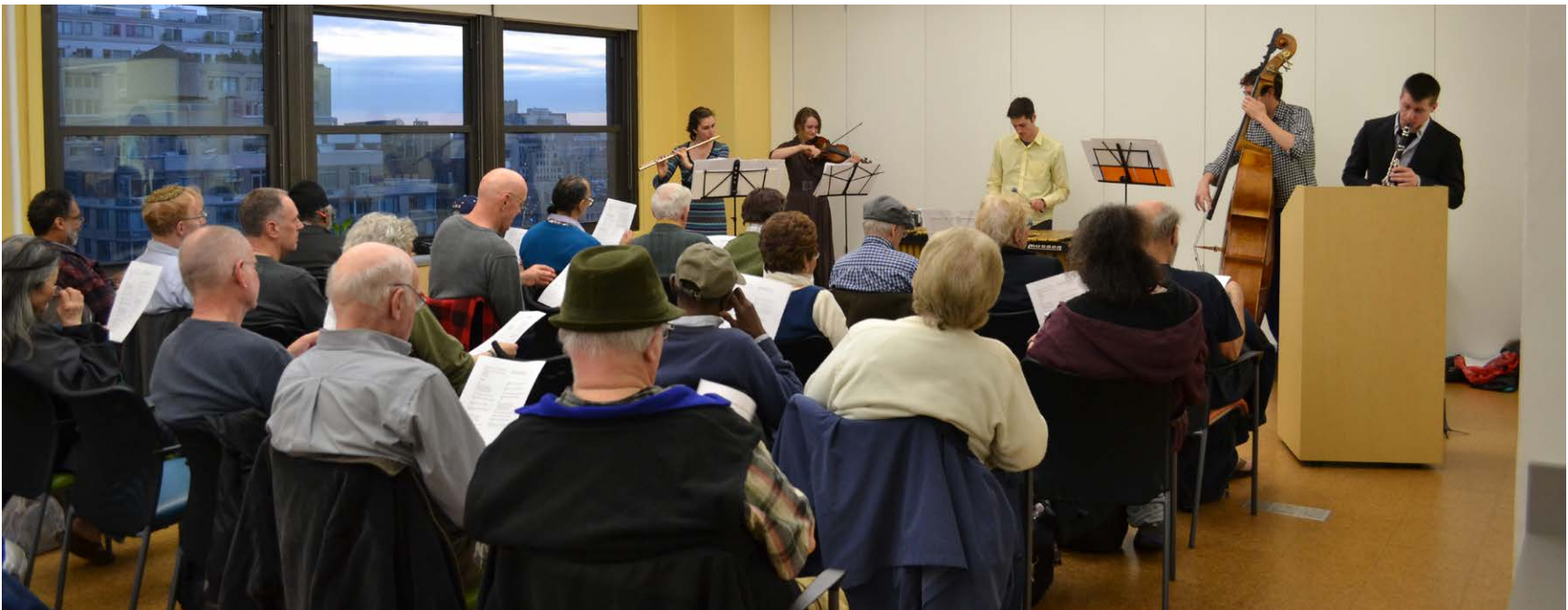
Performance at The SAGE Center (Services and Advocacy for GLBT Elders)

Ensemble ACJW fellows use their unique skill set of peerless musicianship and engagement strategies to present meaningful outreach events that engage the communities in which they live and work. Throughout the season, they participate in community-based performances at multiple non-traditional venues across New York City through Musical Connections, a program of Carnegie Hall’s Weill Music Institute. This program is designed to bring music to people coping with challenging circumstances in healthcare settings, correctional facilities, and senior-service organizations. Fellows also perform each year as part of WMI’s Neighborhood Concert series, which provides free concerts to audiences in all five boroughs of New York City.