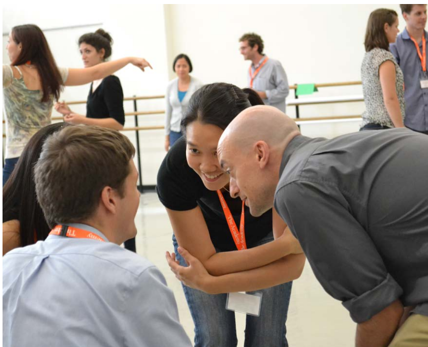
Professional development workshop

Throughout the two-year program, Ensemble ACJW fellows are supported by rigorous, ongoing professional development to ensure that they gain the necessary skills to be successful in all areas of the program and to become leaders in their field. Areas of emphasis include artistic excellence, engagement strategies both on and off the stage, advocacy, professional skills, and preparation for their work in the schools. Sessions are led by experts in the performing arts field, professional teaching artists, and ACJW alumni. Coaching sessions are also provided for fellows, as well as access to world-renowned composers such as Meredith Monk, Thomas Adès, John Adams, David Lang, and Steve Reich.