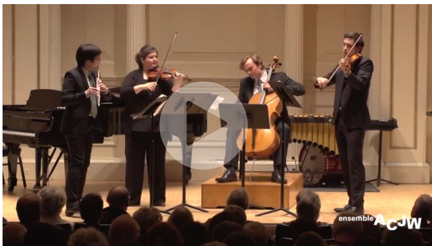
Ensemble ACJW: Mozart Flute Quartet in D Major, K. 285