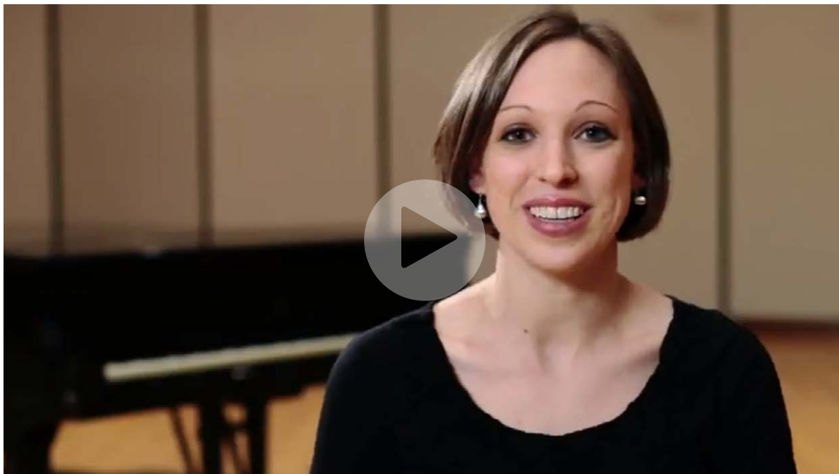
Ensemble ACJW: A Versatile 21st-Century Ensemble

Ensemble ACJW has earned accolades from critics and audiences alike for the quality of its performances, as well as its fresh and open-minded approach to performance and programming. In a variety of venues, its members have played a wide range of music—from centuries past to works written days before an event—in a variety of performance venues. The group performs its own series at Carnegie Hall and has regularly appeared at The Juilliard School's Paul Hall and other venues throughout New York City, including (Le) Poisson Rouge nightclub in Greenwich Village, Subculture in NoHo, and Galapagos Art Space in Brooklyn.