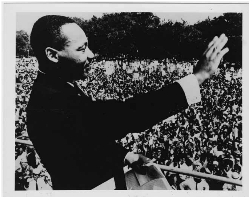
Dr. Martin Luther King Jr. delivering his famous "I Have a Dream" speech at the Lincoln Memorial in 1963.