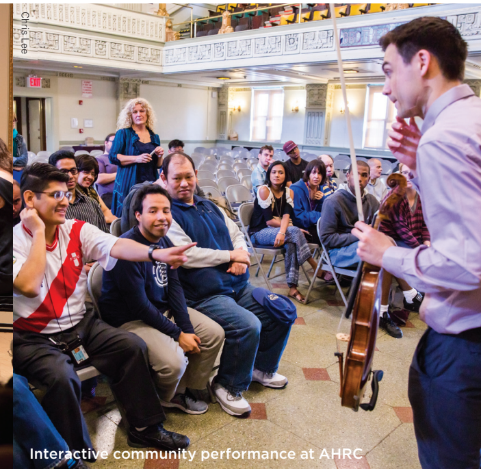
Interactive community performance at AHRC