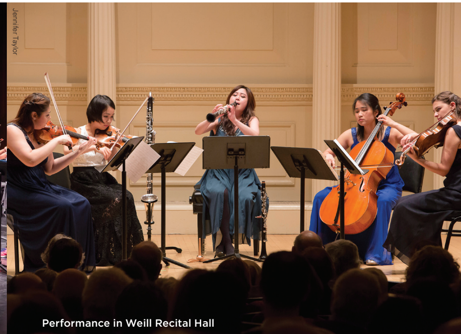
Performance in Weill Recital Hall