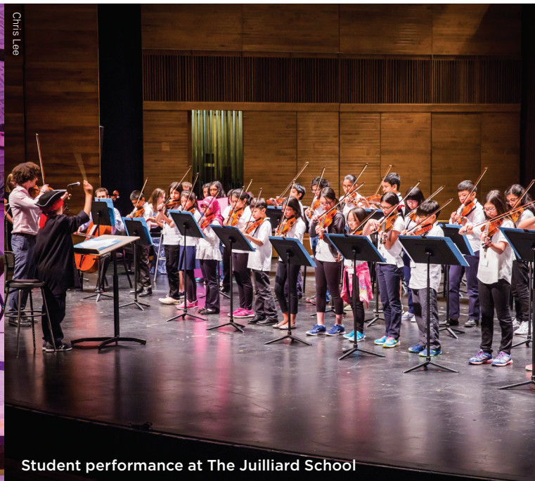
Student performance at The Juilliard School