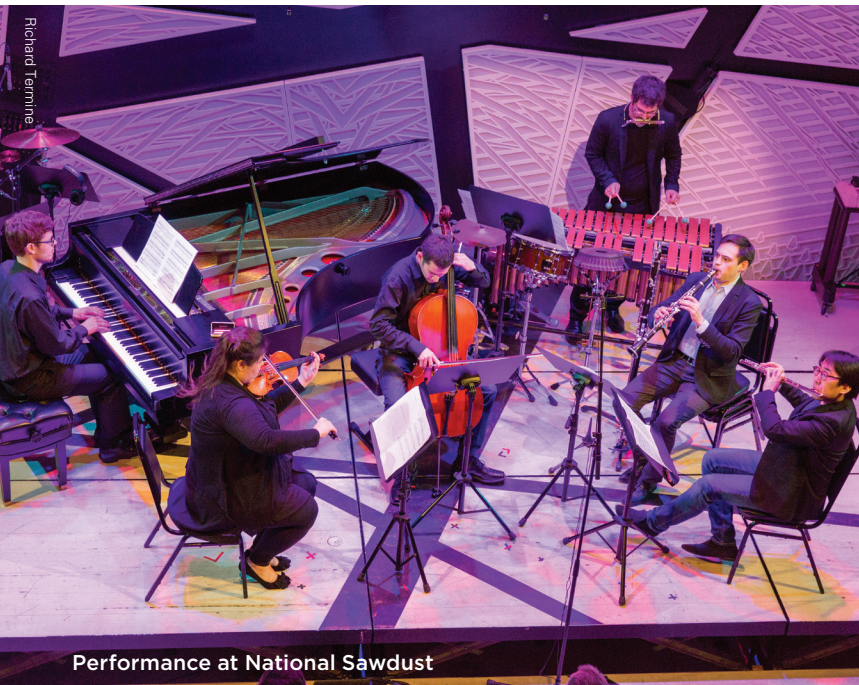
Performance at National Sawdust