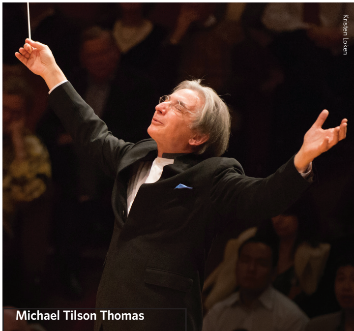
Michael Tilson Thomas

SCHUBERT String Quartet in D Minor, D. 810, "Death and the Maiden" (arr. for string orchestra by Mahler)