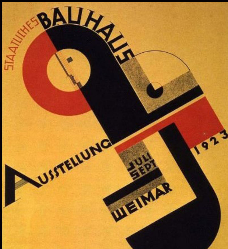
Poster for Bauhaus exhibition by Joost Schmidt (1923)

Artists, programs, and dates subject to change. © 2023 Carnegie Hall.