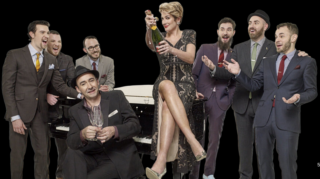
The Hot Sardines

The Hot Sardines are irreverent, swinging, early-jazz specialists. With the help of Alan Cumming, they invoke 1920s Berlin, where cabarets thrummed with American jazz that represented liberation and modernity to some, and a threat—cultural, racial, and sexual—to others.