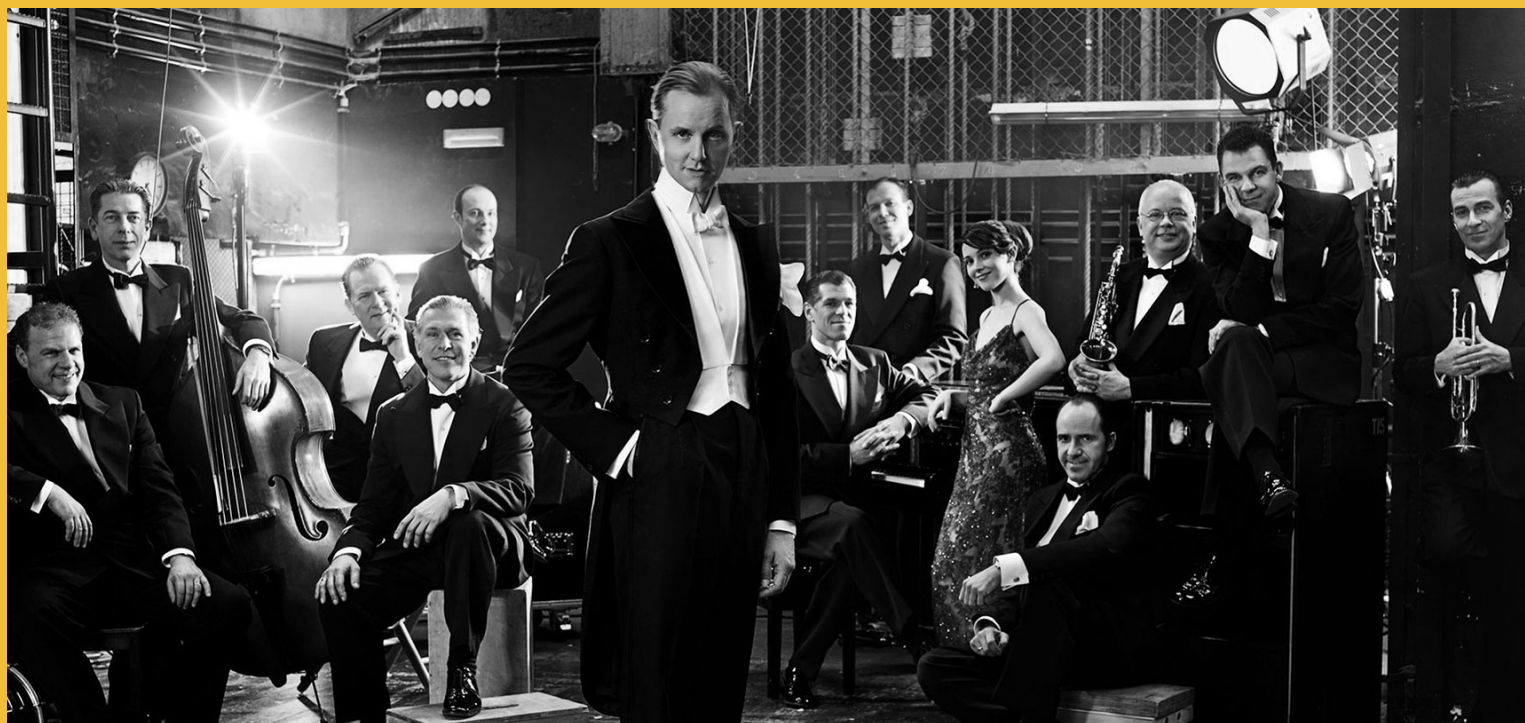
Max Raabe & Palast Orchester