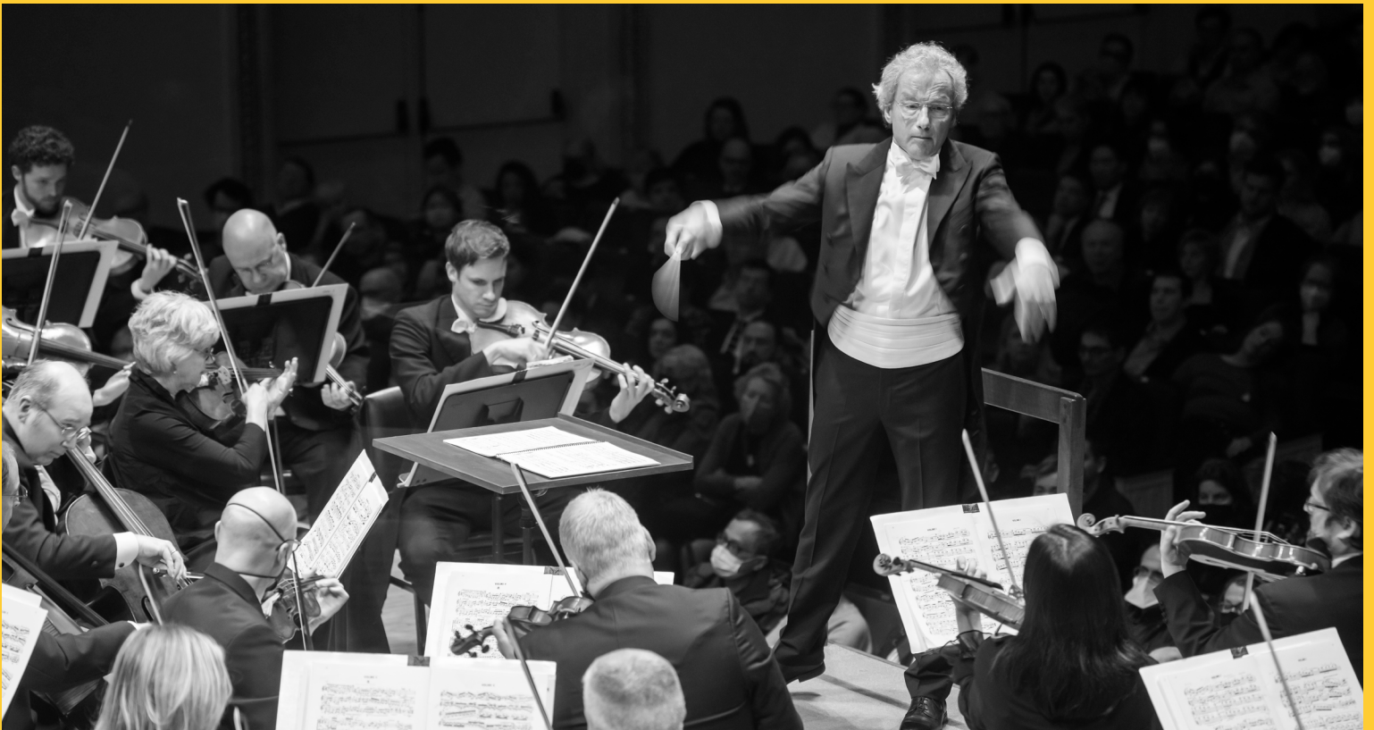
Franz Welser-Möst with The Cleveland Orchestra