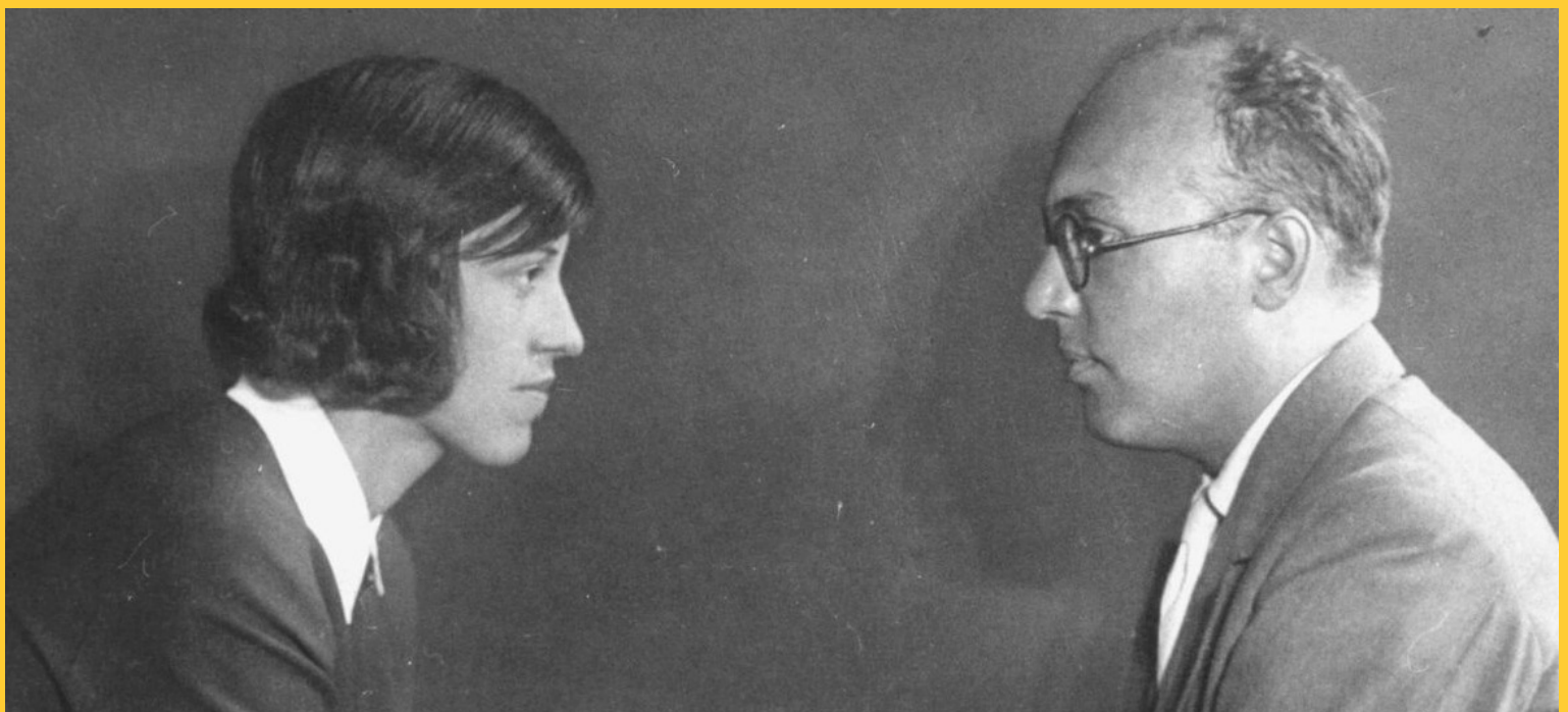
Lotte Lenya and Kurt Weill (1929)

Major support for this concert is provided by the Audrey Love Charitable Foundation.