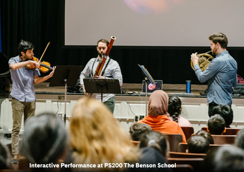
Interactive Performance at PS200 The Benson School