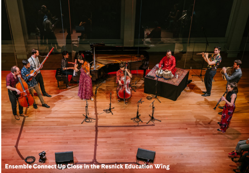
Ensemble Connect Up Close in the Resnick Education Wing