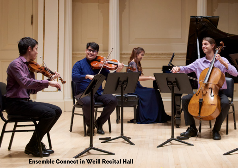
Ensemble Connect in Weill Recital Hall