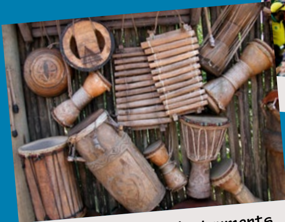
African Percussion Instruments