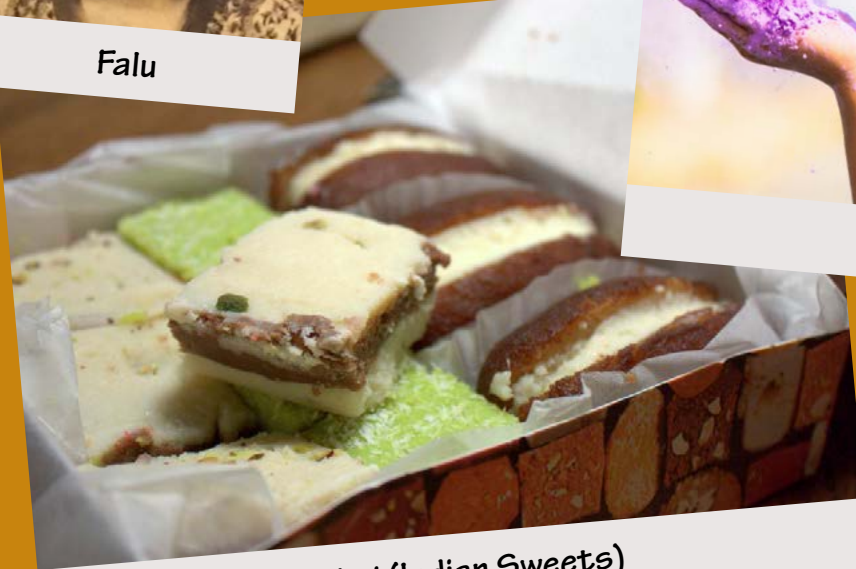
Mithai (Indian Sweets)