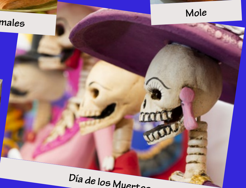
Día de los Muertos