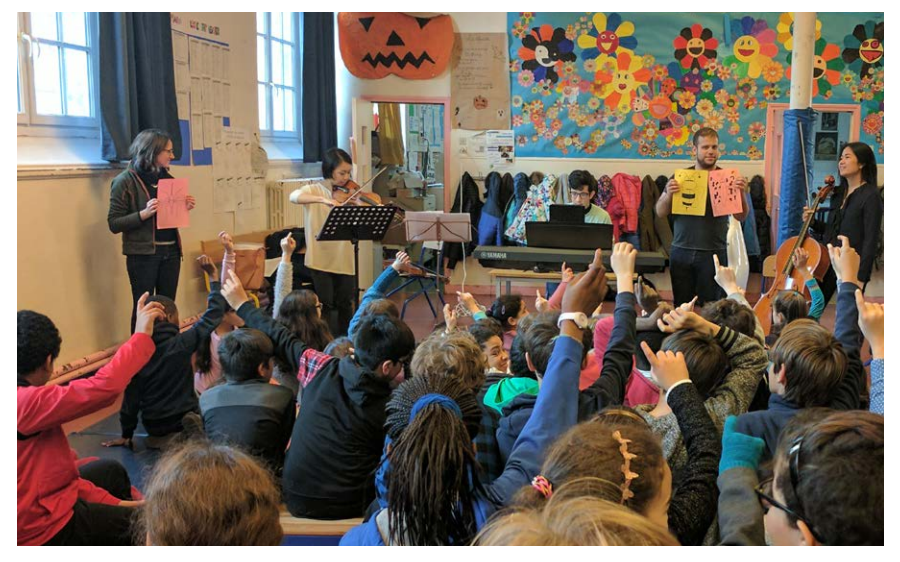
Interactive performance at Dorothy Nolan Elementary School in Saratoga Springs