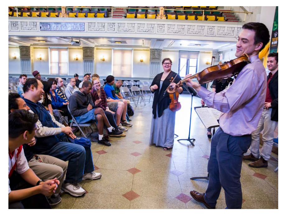
Interactive community performance at AHRC