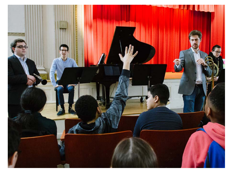
Ensemble Connect fellows presenting an interactive performance at MS224 Manhattan East

Each year Ensemble Connect presents 80 interactive performances in schools and 20 in community venues across New York City. Interactive performances are designed to invite audiences into the exploration and discovery of a piece of music or a musical concept and include listening activities aimed at deepening and enriching the concert experience. Fellows perform these assembly-style for large, schoolwide audiences and also adapt them for community venues such as prisons, senior care facilities, homeless shelters, and organizations working with special needs populations.