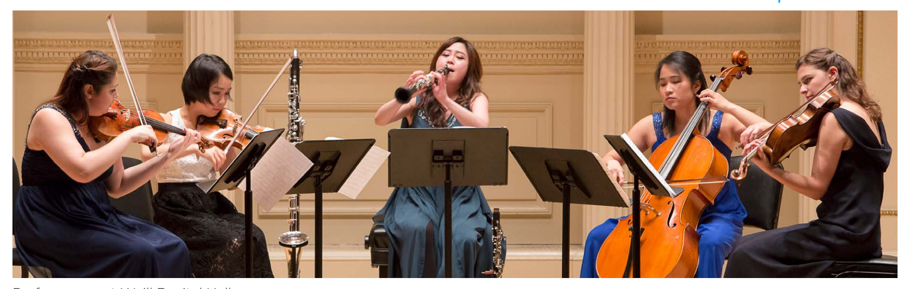
Performance at Weill Recital Hall