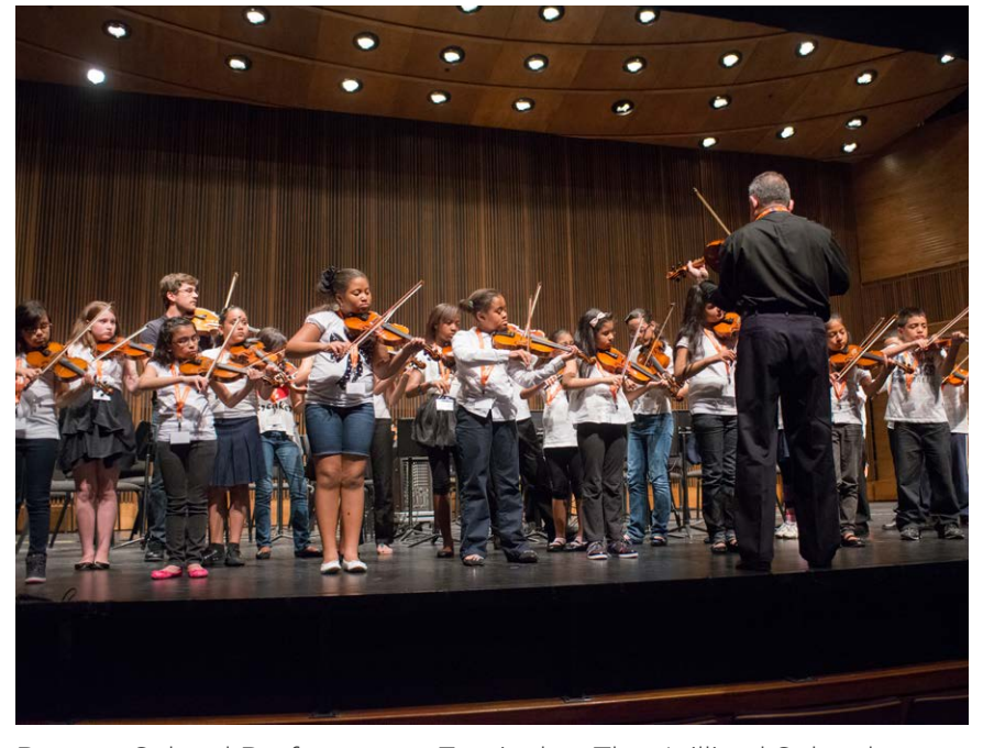
Partner School Performance Festival at The Juilliard School