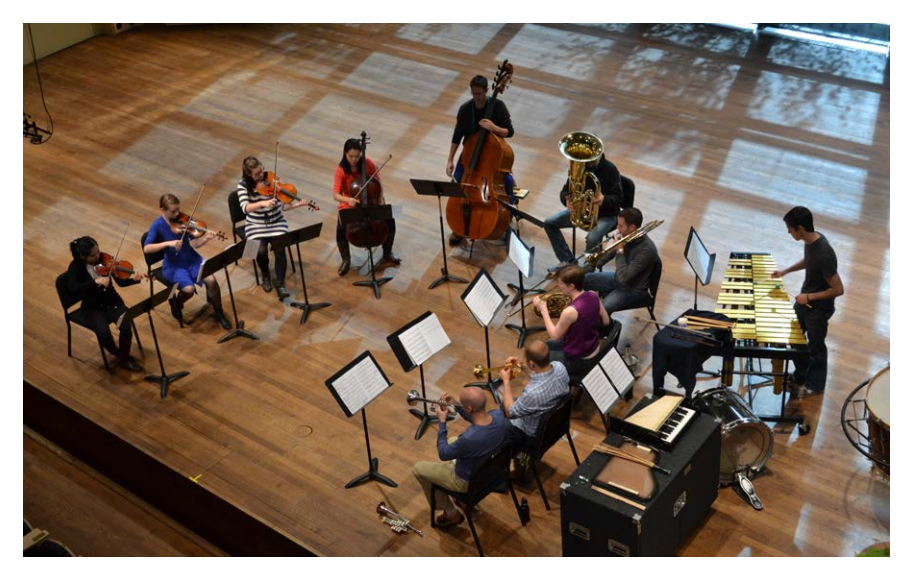
Ensemble Connect rehearsal at Skidmore College

Twice annually, the fellows participate in a five-day residency at Skidmore College in Saratoga Springs, New York. While on campus. the fellows offer master classes, lessons, and class demonstrations, as well as play side by side with students of the Skidmore College Orchestra and read student compositions. Ensemble Connect performs in the Arthur Zankel Music Center's Helen Filene Ladd Concert Hall, presenting concert programs that include world premieres commissioned by Carnegie Hall. The commissioned composers collaborate with the fellows during the residency before the world-premiere performances. In addition, the fellows and composers offer interactive demonstrations and informal performances beyond the music department in classes, dormitories, and libraries, as well as in schools and other community venues in Saratoga Springs.