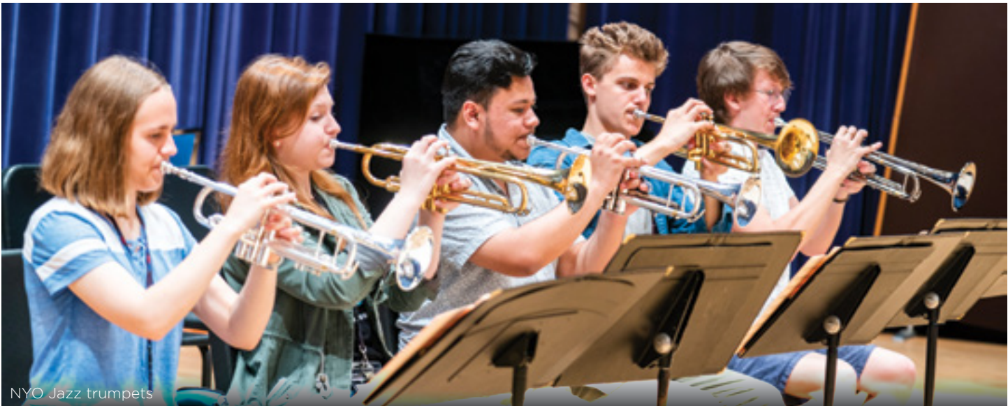
NYO Jazz trumpets