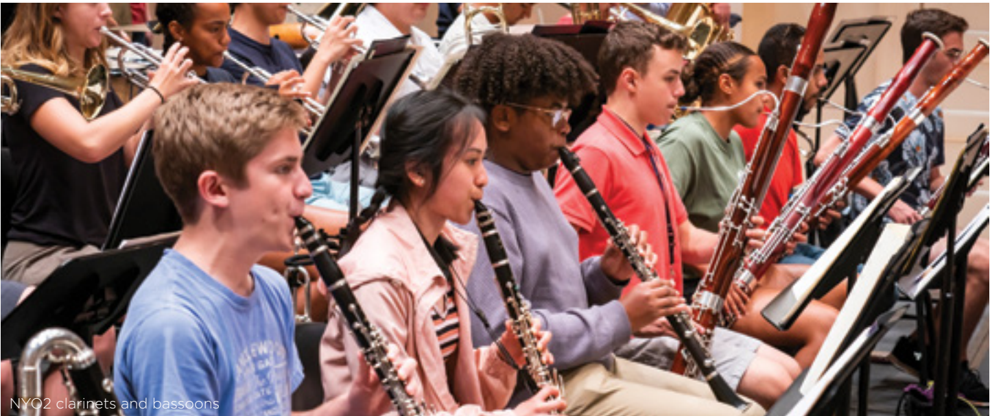
NYO2 clarinets and bassoons