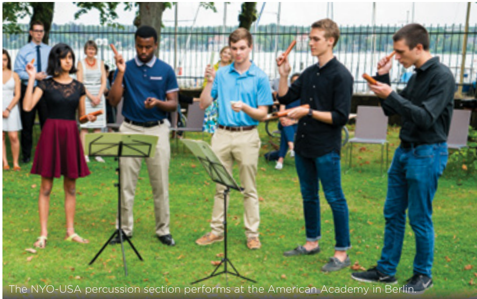
The NYO-USA percussion section performs at the American Academy in Berlin.