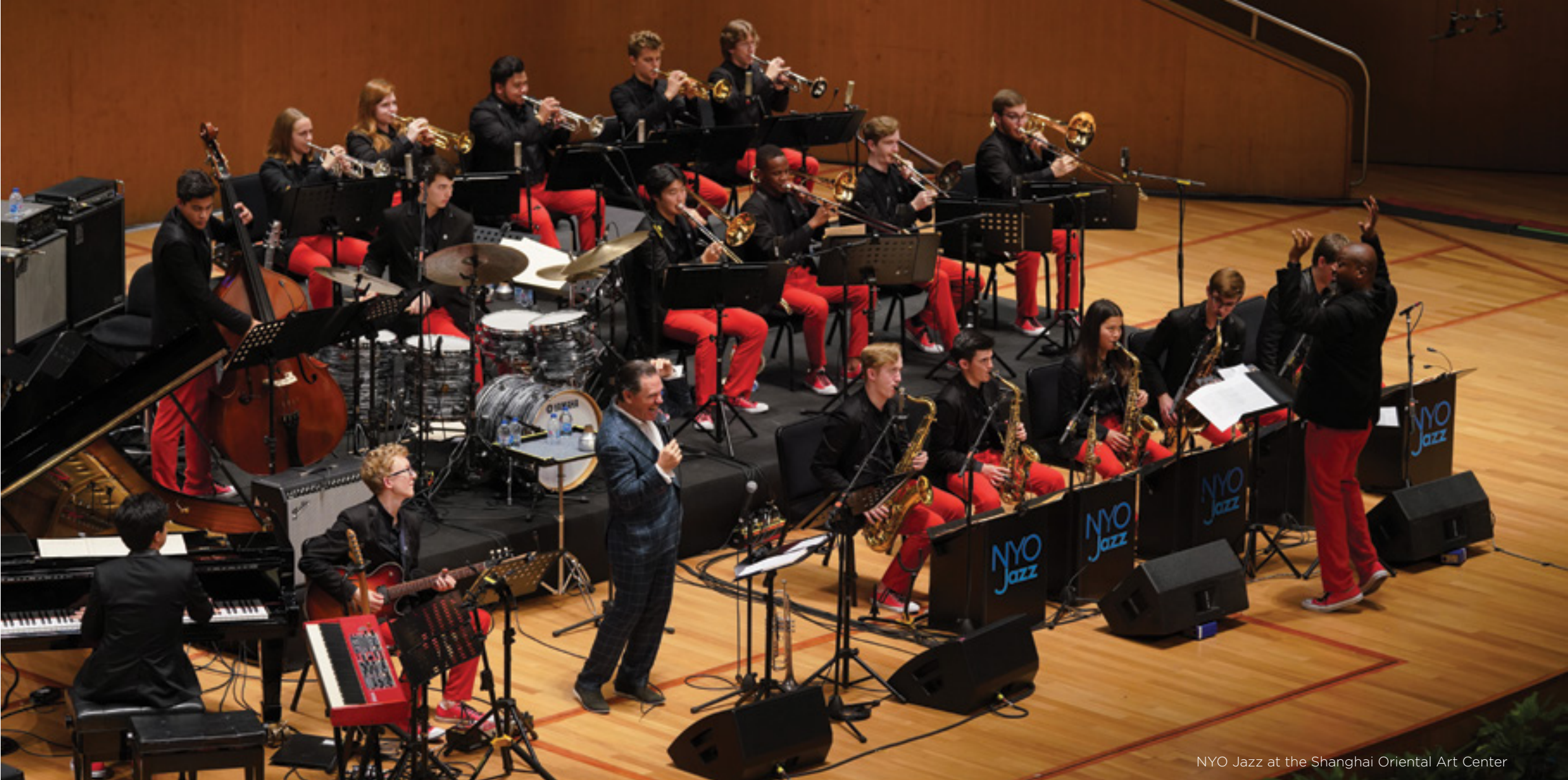
NYO Jazz at the Shanghai Oriental Art Center

Carnegie Hall’s national youth jazz orchestra, NYO Jazz—comprising 23 outstanding young American jazz musicians ages 16–19 from across the US—came together for its second year of extraordinary music making, culminating with the ensemble’s first-ever tour to Asia in the summer of 2019. Acclaimed trumpeter Sean Jones returned to lead the group, with Grammy Award–winning vocalist Kurt Elling featured as guest artist. NYO Jazz’s tour to Asia included debut performances at some of the world’s most prestigious concert halls, inspiring audiences with a beloved American genre of music.