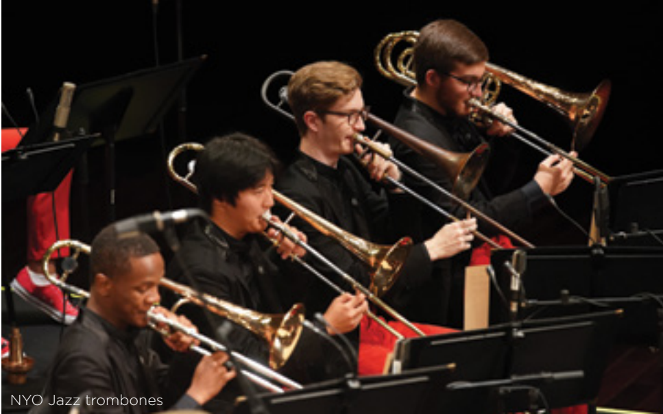
NYO Jazz trombones