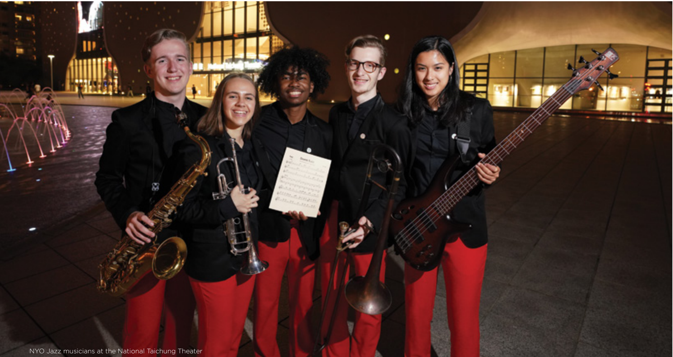
NYO Jazz musicians at the National Taichung Theater

In the summer of 2019, more than 200 of the most talented young musicians from across the country came together for the National Youth Orchestra of the United States of America (NYO-USA), NYO2, and NYO Jazz. Following intensive training residencies at Purchase College, State University of New York, with leading professional musicians, the ensembles embarked on tours to destinations around the world, which were anchored by memorable concerts at Carnegie Hall. NYO-USA traveled to the Tanglewood Music Festival in Lenox, Massachusetts, and then to Europe, returning to London and Amsterdam and making debuts in Berlin, Edinburgh, and Hamburg under the baton of conductor Sir Antonio Pappano with mezzo-sopranos Joyce DiDonato and Magdalena Kožená as guest soloists. (Mezzo-soprano Isabel Leonard was featured at the US performances.) NYO2 traveled to Miami Beach for a residency as part of its continued partnership with the New World Symphony, America’s Orchestral Academy, performing at the state-of-the-art New World Center under conductor Carlos Miguel Prieto. NYO Jazz made its debut tour of Asia, with performances in Taichung, Beijing, Shanghai, Zhuhai, and Hong Kong led by trumpeter and bandleader Sean Jones and featuring vocalist Kurt Elling.