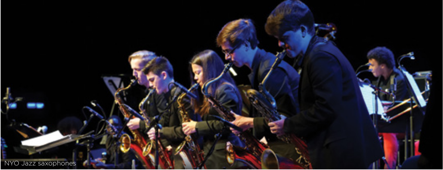
NYO Jazz saxophones