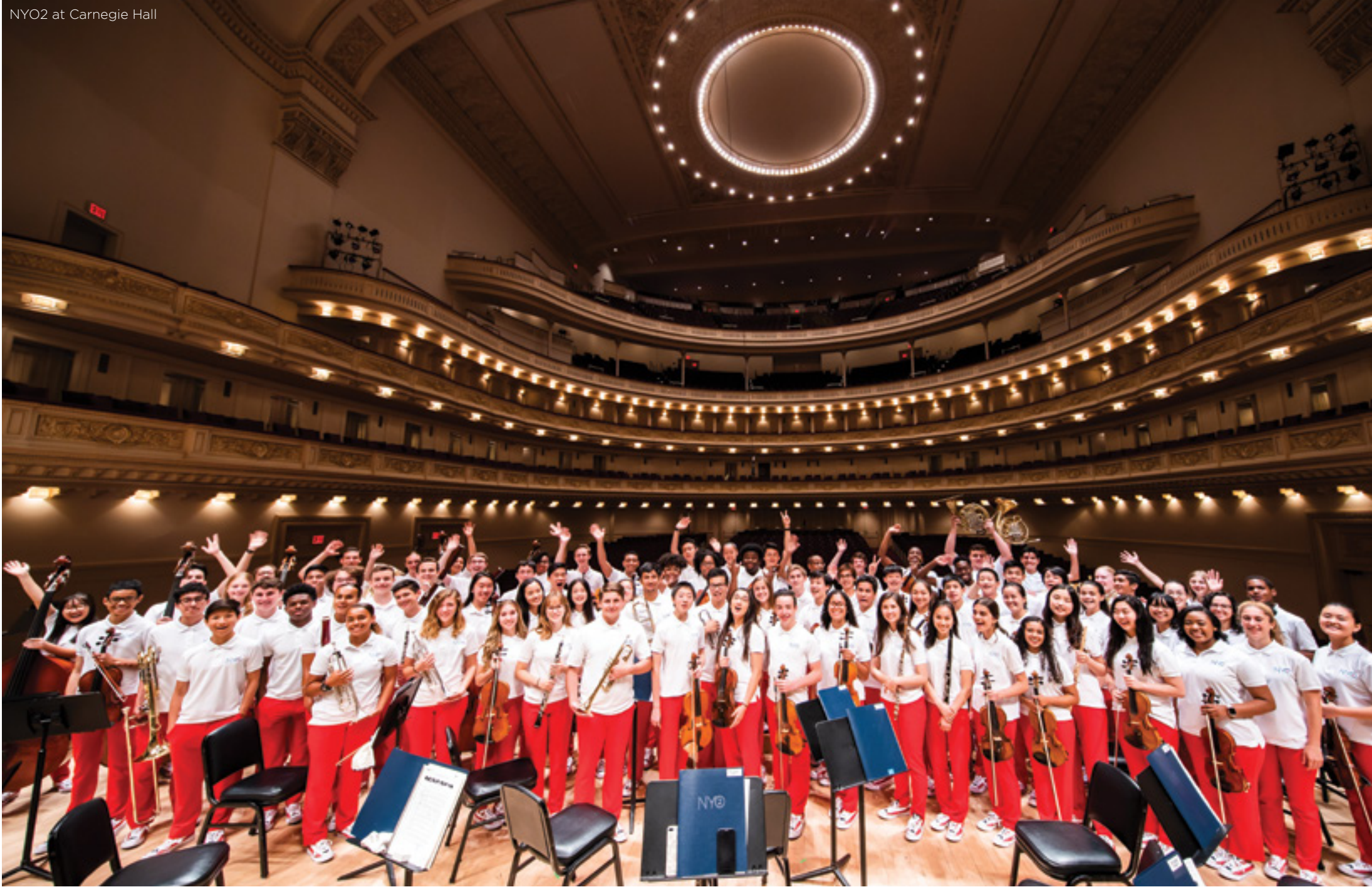
NYO2 at Carnegie Hall