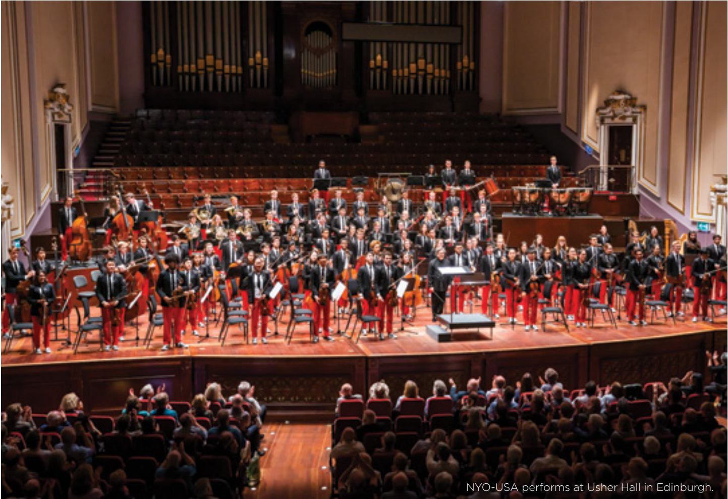
NYO-USA performs at Usher Hall in Edinburgh.

Carnegie Hall gratefully acknowledges the major supporters who made NYO-USA, NYO2, and NYO Jazz’s summer 2019 tours and performances possible.