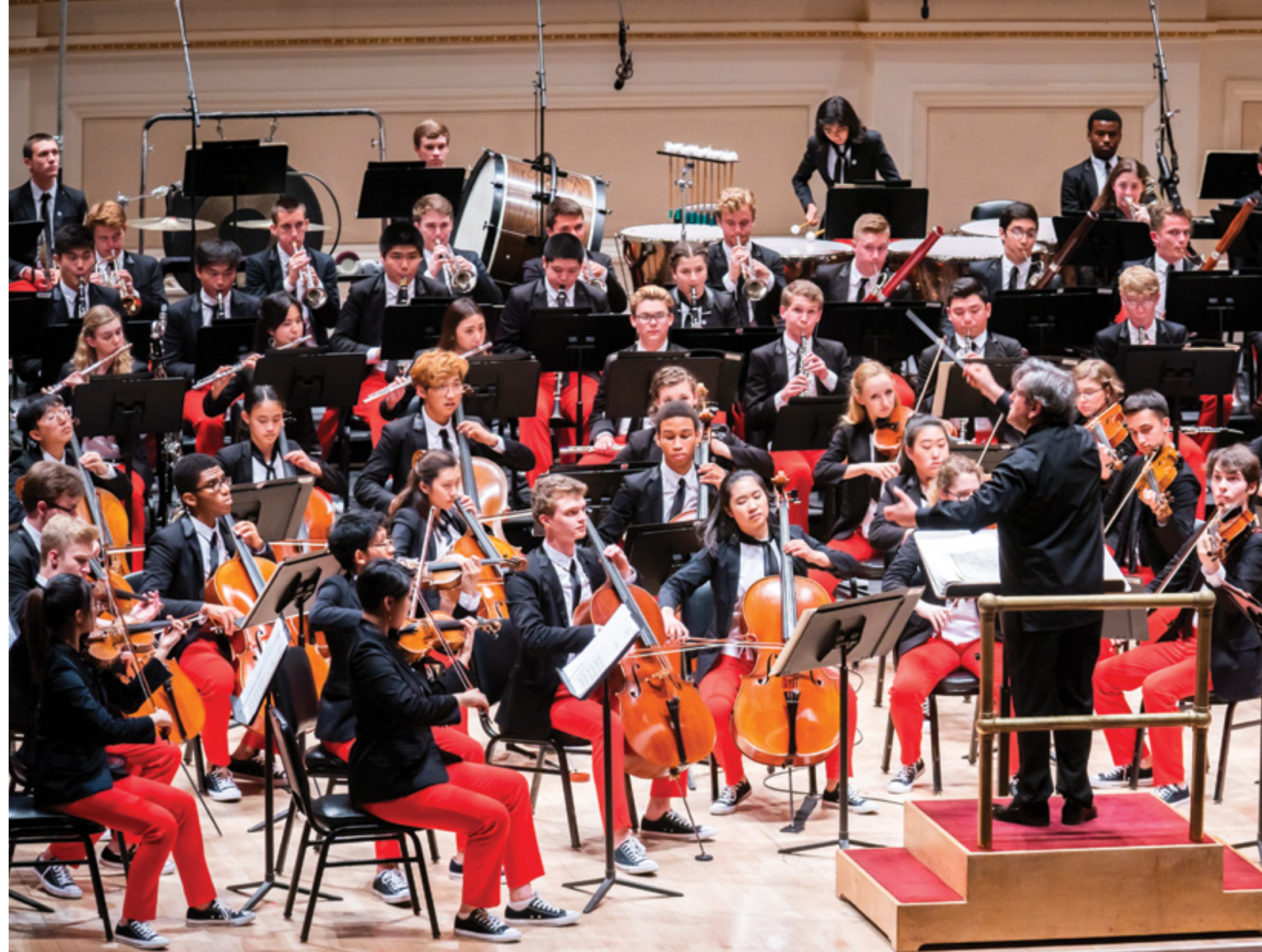
Concert at Carnegie Hall