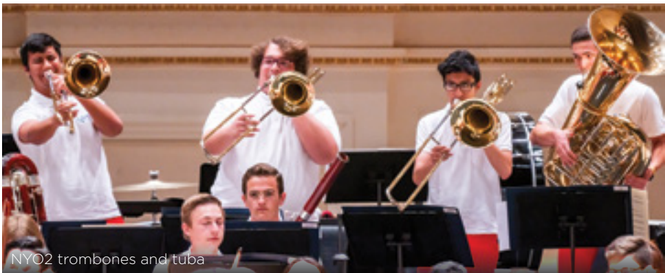
NYO2 trombones and tuba