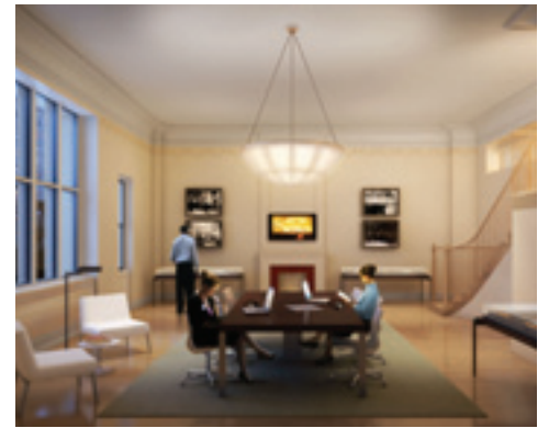
Archives Research Room