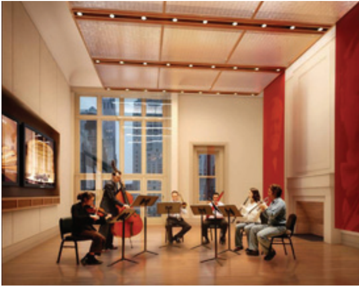
Medium Ensemble Room