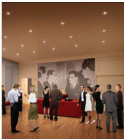
Orchestra Room / Green Room