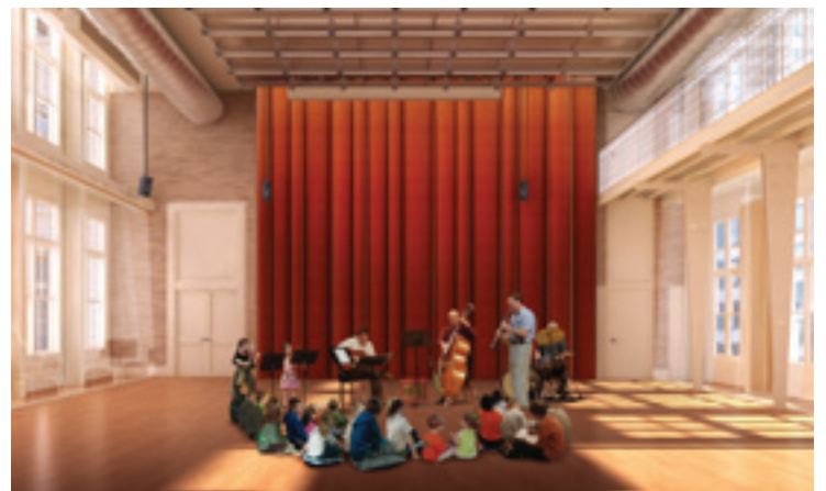
Large Ensemble Room (looking east)