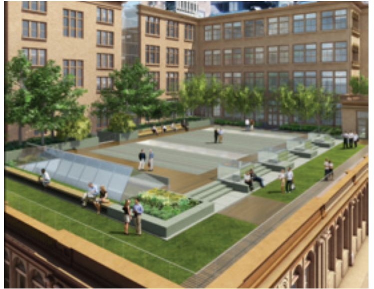
Roof Terrace, Framed by New Education Wing