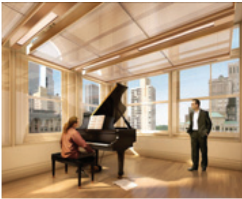
Large Practice Room