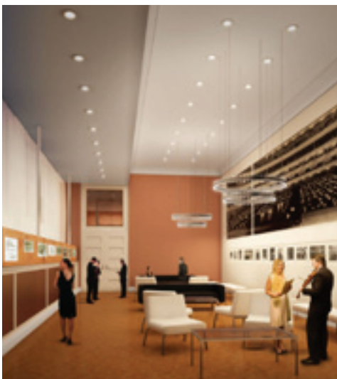
Orchestra Room / Backstage