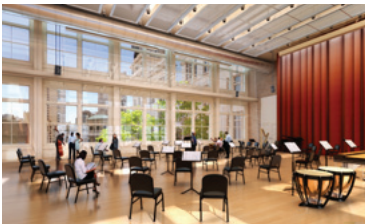
Large Ensemble Room (looking north)